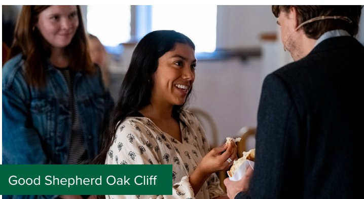
Good Shepherd Oak Cliff