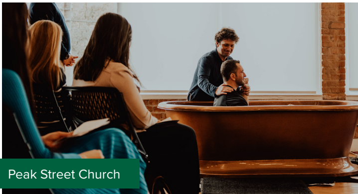
Peak Street Church