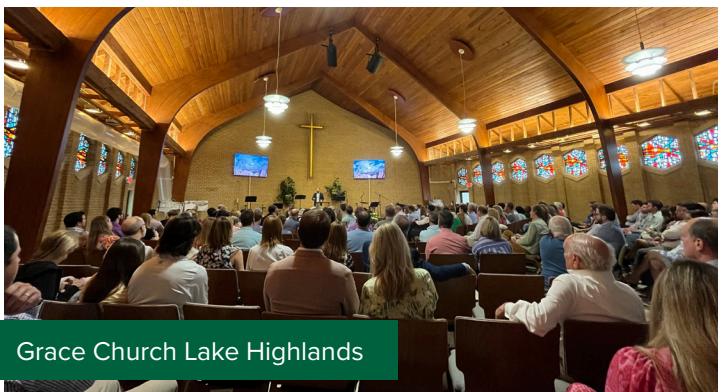
Grace Church Lake Highlands